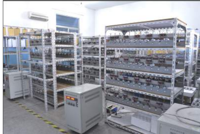
Life Time Testing