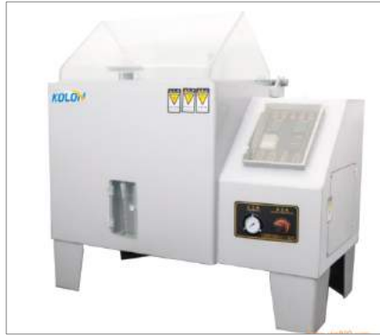
Salt Spray Test Machine