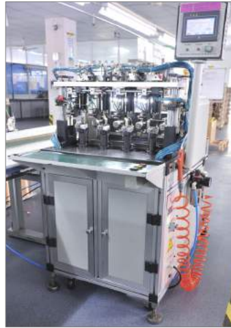
Auto Winding Machine