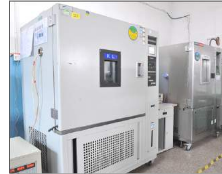
High-Low Temperature Test